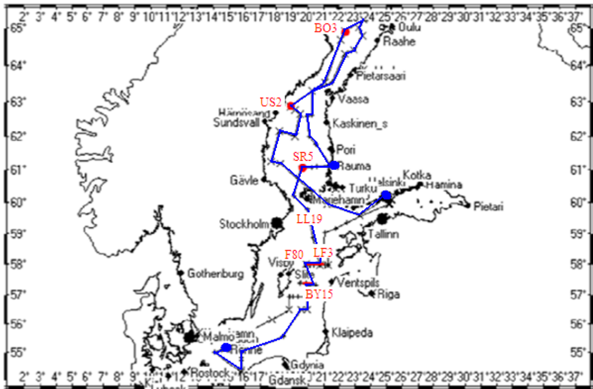
Figure 1: The route of the second and third leg of Aranda cruise