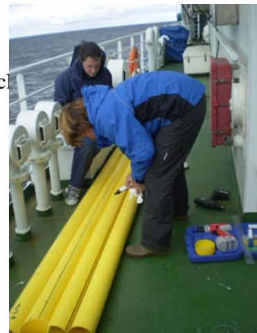
Fig 3: The predrilling core linear for the gravity core

The core from this station did not include the top of the sediments. When the gravity corer hit the sediments the “locker” at the top did not close so we do not really know at what depth this core was taken. The long core for site BY 15 was collected in late afternoon at the 6 th of June. It was sectioned in five 100 cm and one ~40 cm long section and stored in the cold room. The core was in total ~540 cm long. The syringes for the methane samples were put into the core after about one hour but were not removed from it until the pore-water samples were done,