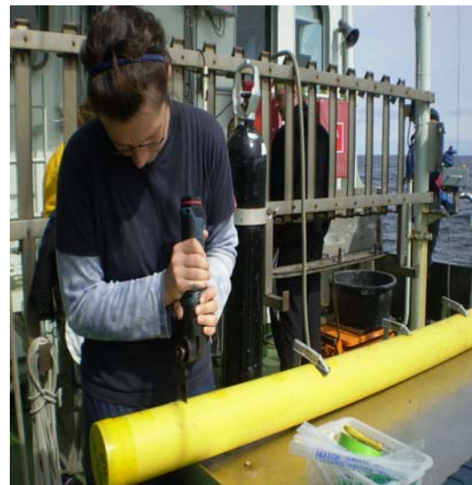
Fig 5: Subsample for solid phase in core linear in Aranda shio

The sub sampling for the porosity and the solid sediments were done after the pore-water was collected. These samples were also collected at 20 cm (with some depths that could not be sampled) interval starting at 40 cm and finishing at 420 cm which resulted in 19 samples each.