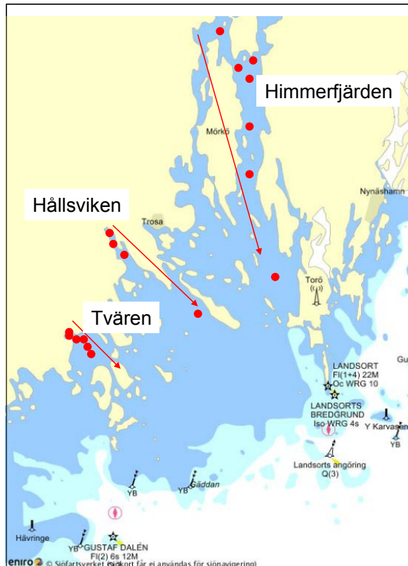
Figure 1. Sampling sites in Himmerfjärden.